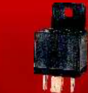
AU-7 / AU-8 / AU-POT